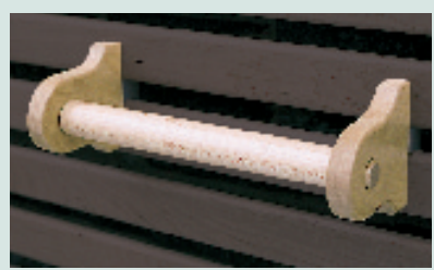
fig 1. Towel holder

The optional cornice is supplied as shown or with one or both ends trimmed square to suit installation.