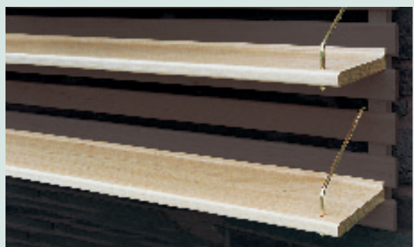
fig 6. Shelves