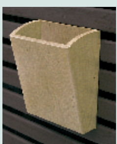
fig 3. Spoon box