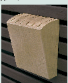
fig 5. Knife block