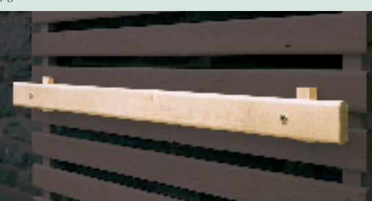
fig 4. Rail for saucepan lids