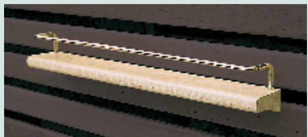
fig 7. Spice rack